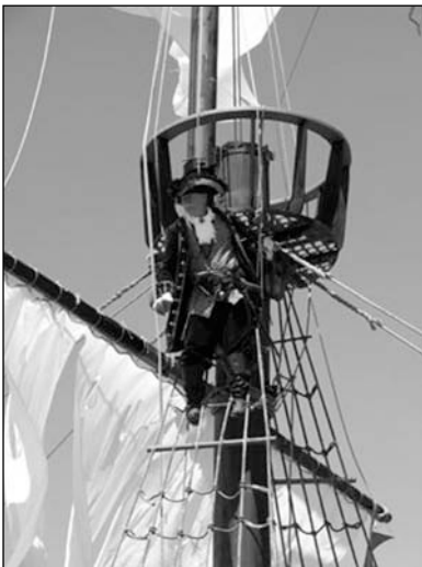
Among the events reviewed on NCPH Off the Wall was the NorCal Pirate Festival at Mare Island, Vallejo in June 2010. Photo and article at http://ncphoffthewall.blogspot.com/2010/07/more-faux-pirates-than-you-can-shake.html

The National Council for Public History's Digital Media Group launched a new digital venture early this summer: a blog called "Off the Wall: Critical Reviews of History Exhibit Practice in an Age of Ubiquitous Display." A well-developed set of conventions for reviewing print media does exist, of course, and public historians are already adept at critically assessing museum exhibits, public art, film, and newer media such as Web sites. But the universe of history-related display continues to expand in many directions and the NCPH blog aims to try to catch up with some of it and to think about how it all relates to public history practice. What are we to make, for example, of a new mall design that mimics a small-town American Main Street? Can street art be considered as public history if it invokes history in some way? Should we incorporate things like vernacular memorials, advertising campaigns, and cell phone apps more fully into our professional dialogue about exhibits? "Off the Wall" aims to pose these kinds of questions. Reviewers include new and experienced practitioners from across the field of public history and some of its adjacent and related disciplines. The group hopes that the blog format will allow for a good deal of response and discussion that will push the conversation about what a history exhibit is, what it might be, and how historians can participate most productively. To visit the blog, go to ncphoffthewall.blogspot.com .